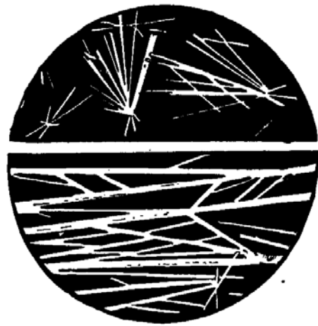
Crystals of concrete volatile oil of lobelia from benzol solution.