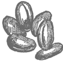
Pollen of Lobelia (Magnified 650 diameters)