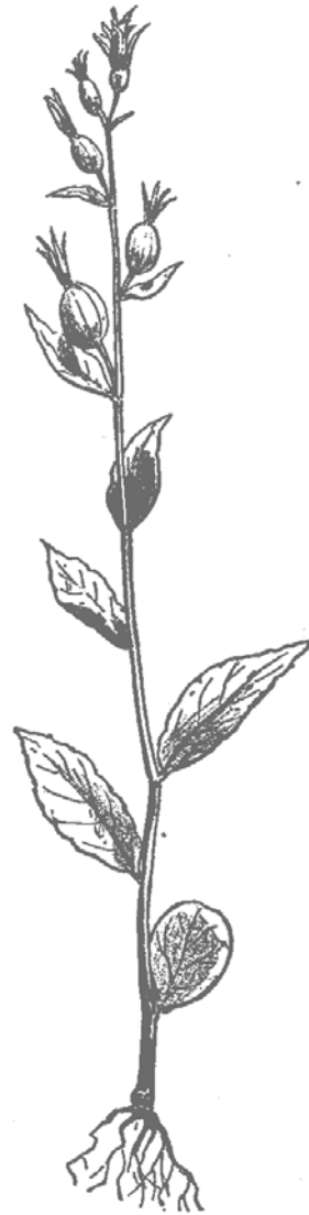
Small flowering plant of Lobelia (natural size)