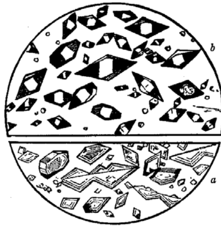
Crystals of inflatin-b, before, a, after action of nitric acid.

Note that early representative authorities of the three principal sections in American Medicine unite in their reports concerning the value and uses of the drug Lobelia.