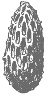
Seed of Lobelia inflata (magnified)