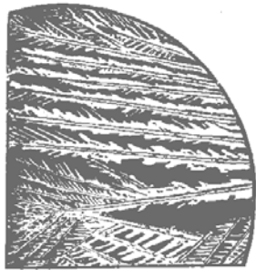
Crystals of inflatin from thin layer of benzol solution (magnified)

From Drugs and Medicines of North America , 1886.